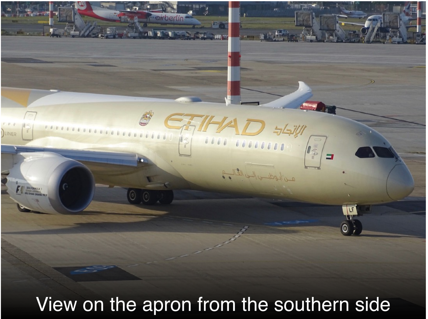
View on the apron from the southern side

If you follow the observation deck clockwise, you get a great view on some apron action.